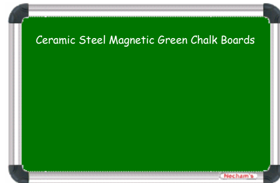
Ceramic Steel Magnetic Green Chalk Boards

These Board has as a very high surface hardness and good abrasion and scratch resistance. It comes with porcelain fused surface at 800 degree Celsius. The matt surface provides excellent writing with minimum pressure and provides easy cleaning. The surface is scratch resistant, rust, fire, water and fungus proof. Negligible reflection occurs with maximum refraction of light which helps the boards to be seen from a wide range of angles and also from a good distance and so the board can also be seen from the last row of the classroom. Twenty five years warranty is provided on the writing surface