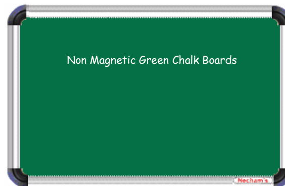
Non Magnetic Green Chalk Boards

Our Non Magnetic Green Chalk Board comes with high pressure melamine coated surface. Extra melamine coated surface for greater life. These Green Boards are very economical and can be used for regular writing purposes. These Green Chalk Boards are ideal for every educational organization for economical regular writing purposes.